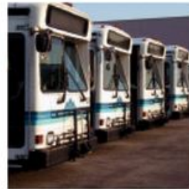
Natural gas powered buses