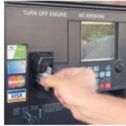
Automated payment system at the dispenser