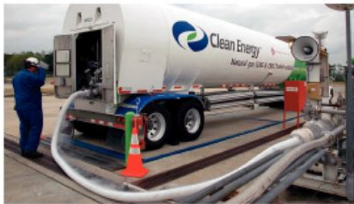
LNG tanker trailer