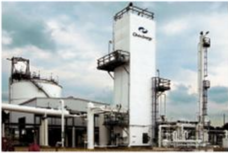
The Pickens Plant, an LNG liquefaction plant located in Willis, Texas