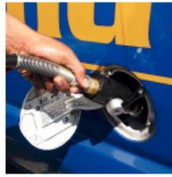
Dispensing CNG at fueling station