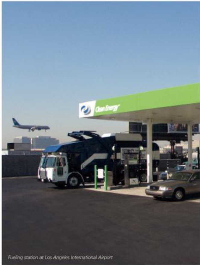
Fueling station at Los Angeles International Airport