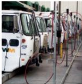
Natural gas powered refuse haulers