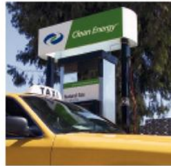
Small CNG fueling station